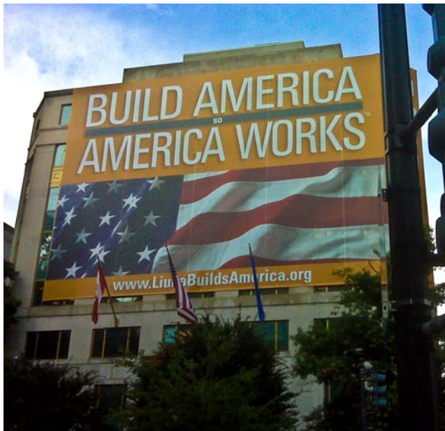
LiUNA Headquarters, Washington D.C.

5000 Rocklin Road, Rocklin, CA 95677 (916) 660-8231 www.fuse1212.org